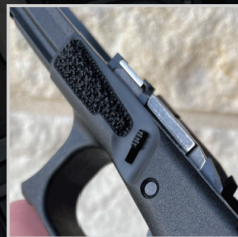
AGENCY ARMS ACCELERATOR