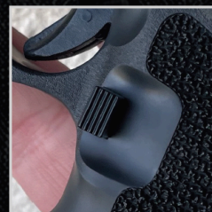
MAG SCALLOP *GEN 3 ONLY*