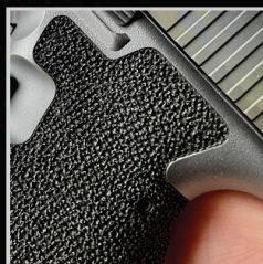
NON FULL TANG