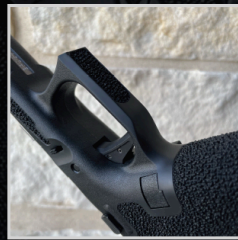
SINGLE W/ CHAMFER